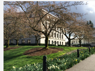
John Cherberg Building houses Senate offices and hearing rooms