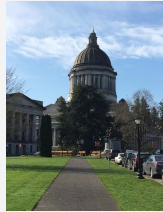
Sunny morning in Olympia