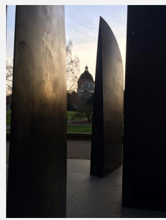
The Legislative Building from the World War II Memorial at sunset